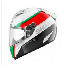
Race-R Pro Carbon