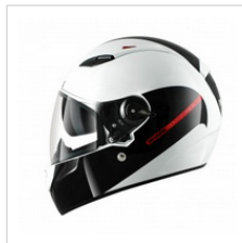
Vision-R GT Carbon